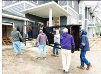
Friends help Grey Fox move to the new store on December 28.